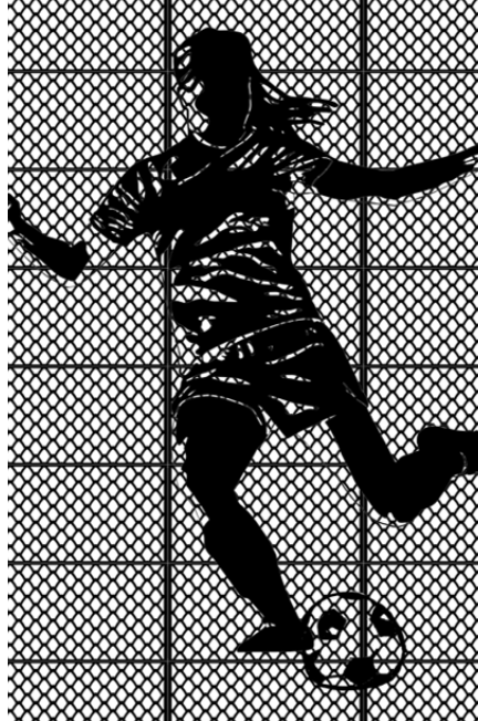
Solid body MESH approach

The installation team benefitted from the fact that the ParaClad system installs like a kit and requires no cutting, drilling, or finishing in the field. Each component was labeled according to installation diagrams provided by Parasoleil installation support team to help streamline the installation process. The complete installation was completed by a two-person crew in approximately 10 days, saving time and money.